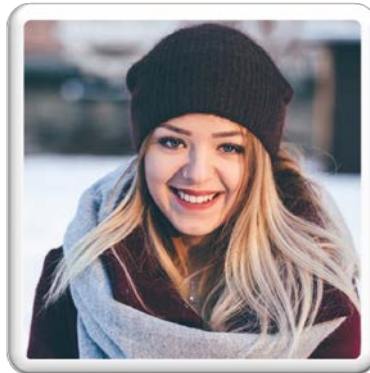
This institution is an equal opportunity provider and employer.

Provides urgent and complete dental care for children and adults. NC Medicaid, Health Choice, and self-pay accepted.